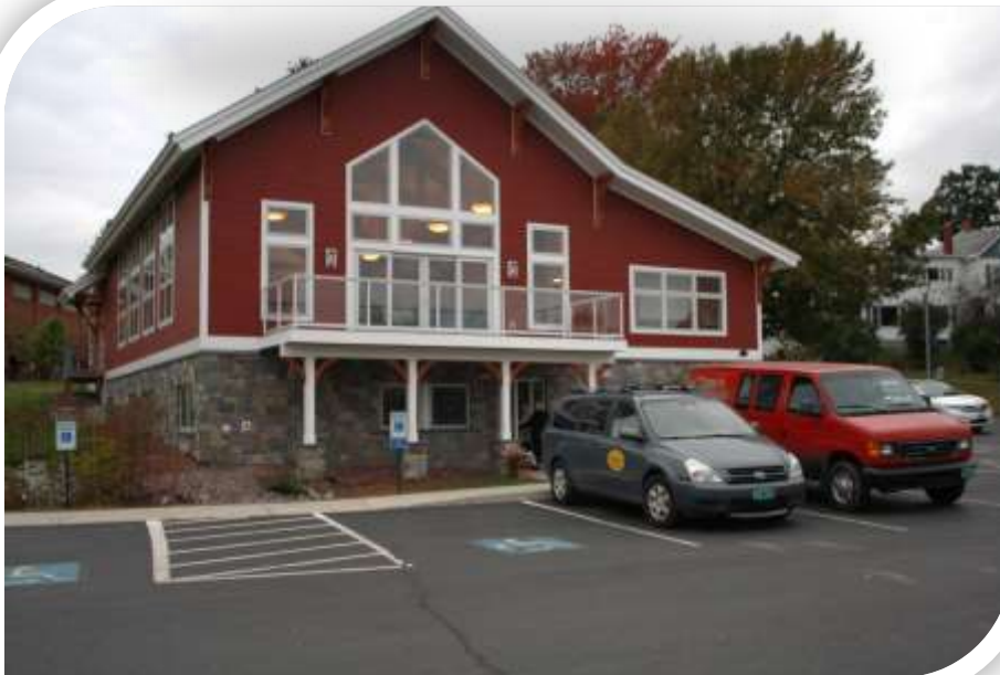
Activities took place at Holy Family/St. Lawrence Parish Hall in Essex Jct., VT